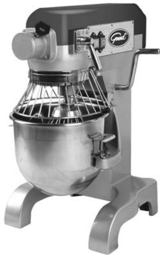
GEM110 10 Quart Mixer